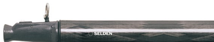
Female casting for clip-on spigot.