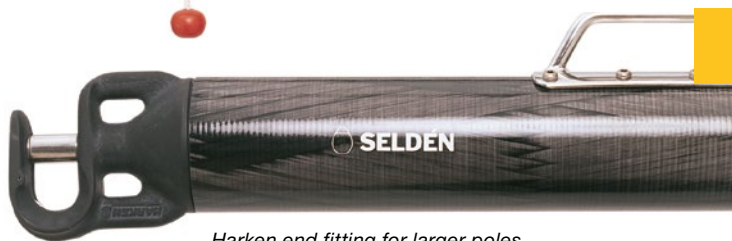
Harken end fitting for larger poles.

Weight comparison – aluminium and carbon spinnaker poles (equal strength). Aluminium spinnaker pole Section 99/99, length 5150 mm, weight 16.9 kg. Carbon spinnaker pole Section 102/102, length 5150 mm, weight 9 kg.