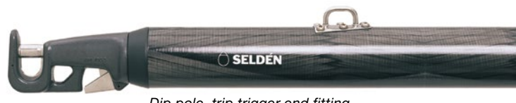
Dip pole, trip trigger end fitting.