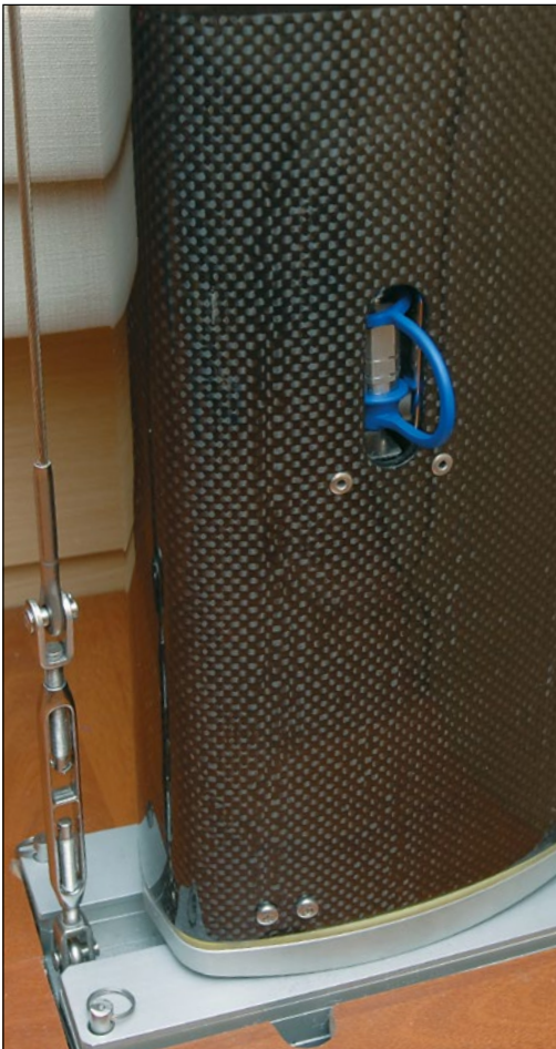
The hose is stored in a hose garage...