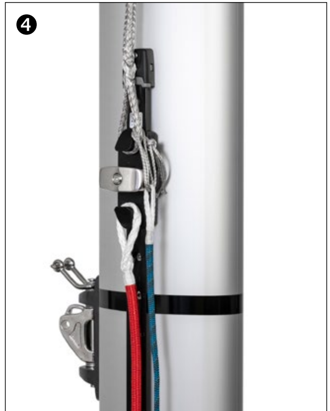
4. Attach a tail-line to the lower becket and lead it to a winch. Twist the handle to the closed position.