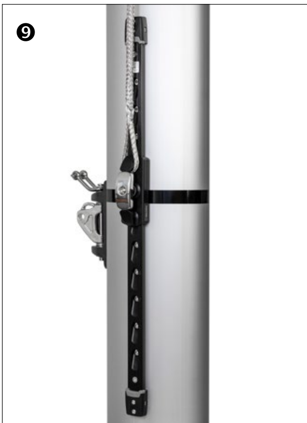
9. Close the handle.

The car is machined and anodized aluminium with plain bearings and a spring-loaded twist handle with stainless plunger. The beackets are designed to extend the curve of the handle preventing lines from snagging. The track is a machined and anodized aluminium extrusion with c-c 50 mm between the slanted trim positions. Two halyard tensioners can be installed side-by-side with a minimum distance of c-c 52 mm.