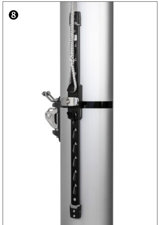
8. Remove the tail-line