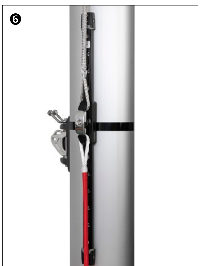
6. Undo the messenger line