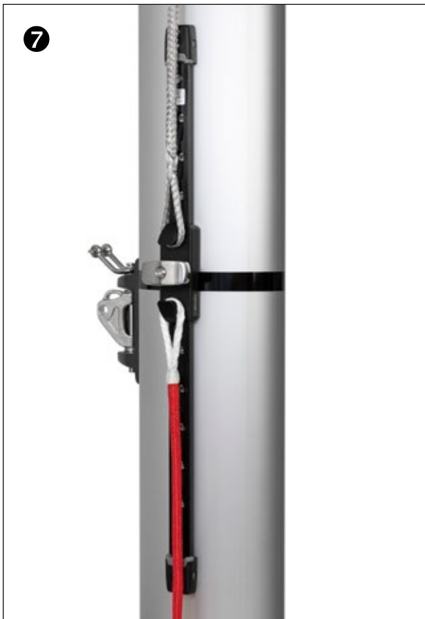
7. The car is now under tension and the handle can be opened by pulling and twisting it 90°.