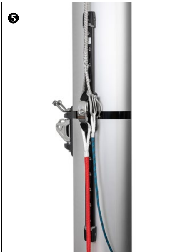
5. Tension until the desired luff shape is achieved.