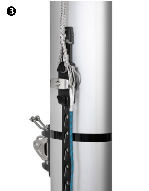
3. Pull and twist the handle to open position and attach the spliced eye of the halyard to the car.