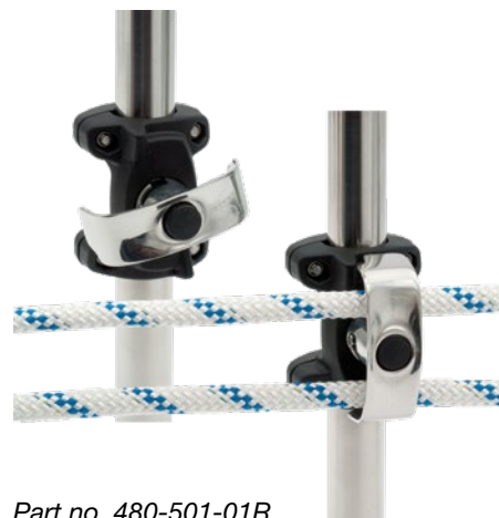
Part no. 480-501-01R