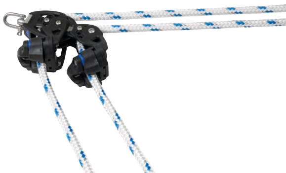
Part no. 405-001-40R (max \varnothing 10 mm line) Part no. 406-001-40R ( \varnothing 12 mm line)