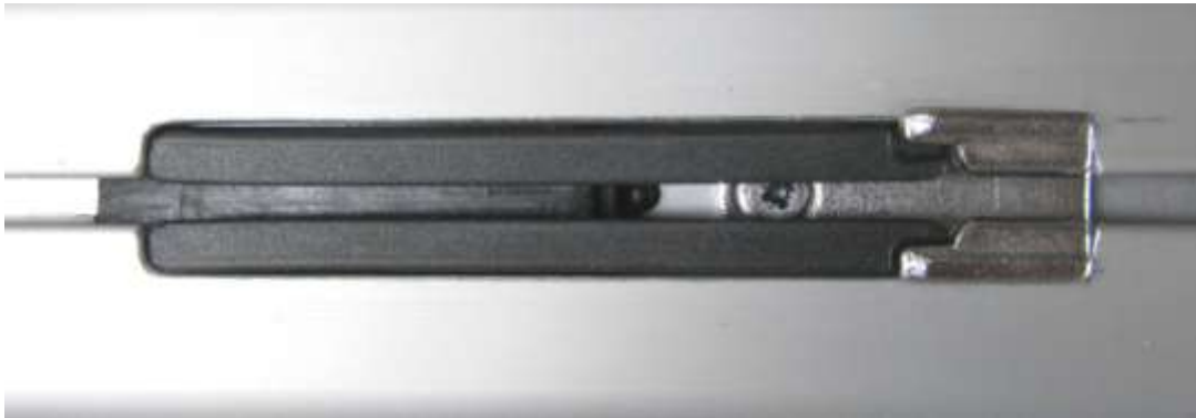
Standard Track Gate 505-533-01