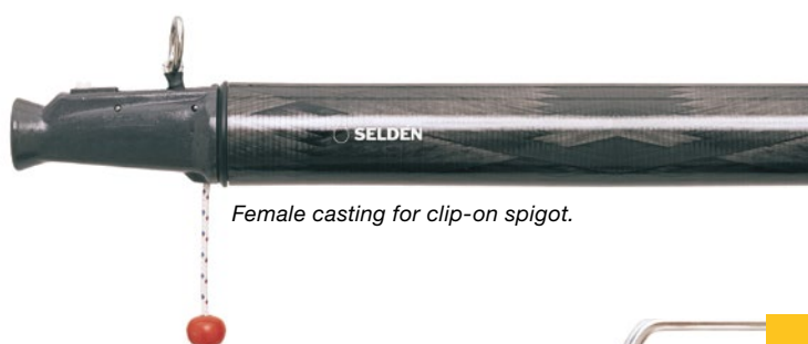
Female casting for clip-on spigot.