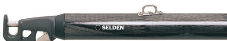
Dip pole, trip trigger end fitting.