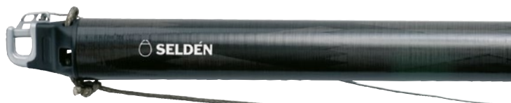
Carbon spinnaker poles (dimensions 77/77 and 88/88) with medium composite end fittings, trip trigger and Dyneema bridle.