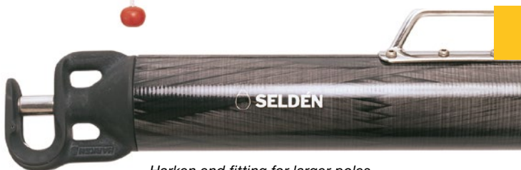
Harken end fitting for larger poles.

Weight comparison – aluminium and carbon spinnaker poles (equal strength). Aluminium spinnaker pole Section 99/99, length 5150 mm, weight 16.9 kg. Carbon spinnaker pole Section 102/102, length 5150 mm, weight 9 kg.