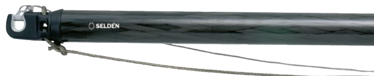
Carbon spinnaker poles (dimensions 47/47 and 59/59) with small composite end fittings and Dyneema bridle.

Seldén spinnaker poles are designed to make light work of spinnaker handling. The big advantage of carbon fibre is its low weight. The weight savings enable the crew to handle the spinnaker faster, with less effort.