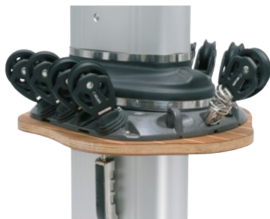
Deck ring with moulded mast coat.

Tie rods with four fixed settings – plenty of leeway for adjustment.