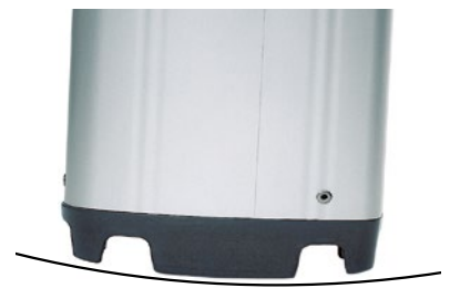
Convex underside of heel plug – distributes compression load evenly on the mast section.