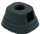
Block stand-up, rubber. Art. No. small 319-512 (PBB50) Art. No. medium 319-669 (PBB60/70) Art. No. large 319-680 (PBB80)