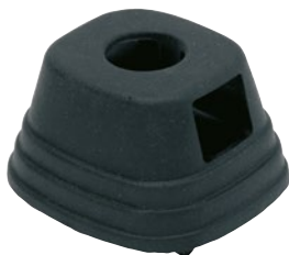
Block stand-up, rubber.