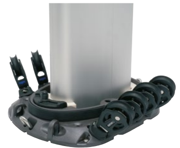
Secure the mast by tightening the nut on the wedge.