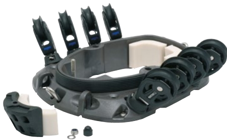
Remove the wedge.

The underside of the heel plug is convex, in order to allow rake without subjecting the mast section to point loading.