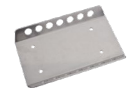
Stainless rail, Art. No. 508-728 and 508-179