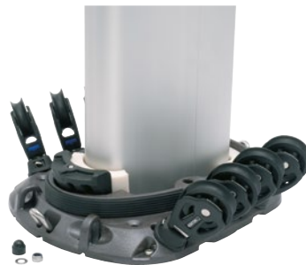
Step the mast and replace the wedge.