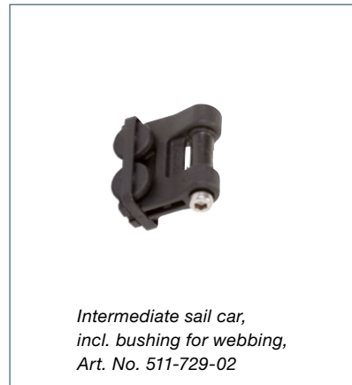
Intermediate sail car, incl. bushing for webbing, Art. No. 511-729-02