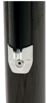
Custom PVC track.

The track has a large bonding surface for attachment to the mast. This helps to increase its strength and durability.