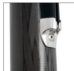
Carbon mast sail feeder.