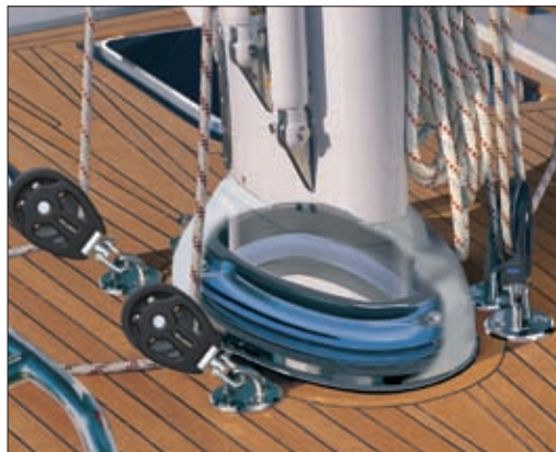
The passage of the mast through the deck is sealed by a sturdy O-ring, squeezed vertically between two deck rings. The lower ring is permanently bolted to the deck and is easy to fit. When in place, it allows sufficient mast movement in all directions.