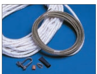
Main halyard kit.