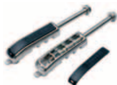
Tie rods with four fixed settings – plenty of leeway for adjustment.