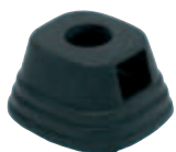
Block stand-up, rubber. Art. No. small 319-512. Art. No. medium 319-669. Art. No. large 319-680.