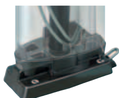
Stainless rail, Art. No. 508-727, 508-728 and 508-179