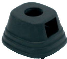
Block stand-up, rubber.