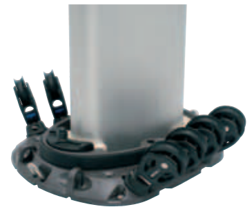
Secure the mast by tightening the nut on the wedge.