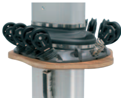
Deck ring with moulded mast coat.