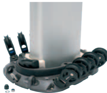
Step the mast and replace the wedge.