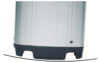
Convex underside of heel plug – distributes compression load evenly on the mast section.