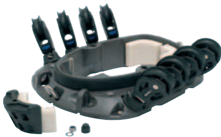
Remove the wedge.

The underside of the heel plug is convex, in order to allow rake without subjecting the mast section to point loading.