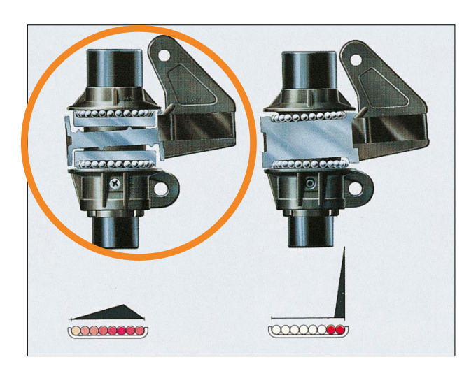
The Seldén load distributor prevents...