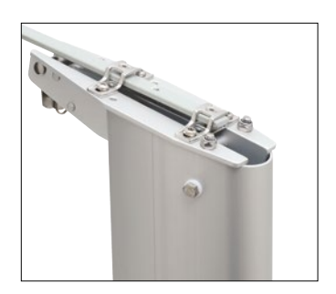
The backstay flicker comes complete with fasteners and backstay block.

The backstay flicker is a glass fibre rod fitted to the head box on a fractional rig with swept spreaders. It lifts up a wire or rope backstay to allow for free passage of a full roach mainsail.