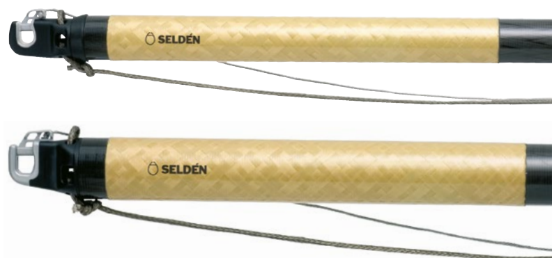
Twaron protection can be supplied as an option. Twaron filaments protect the pole from damage caused by the forestay and shrouds.