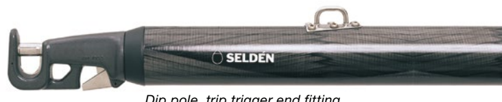
Dip pole, trip trigger end fitting.