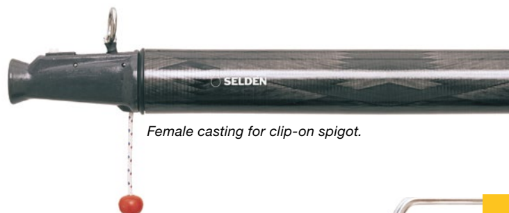
Female casting for clip-on spigot.