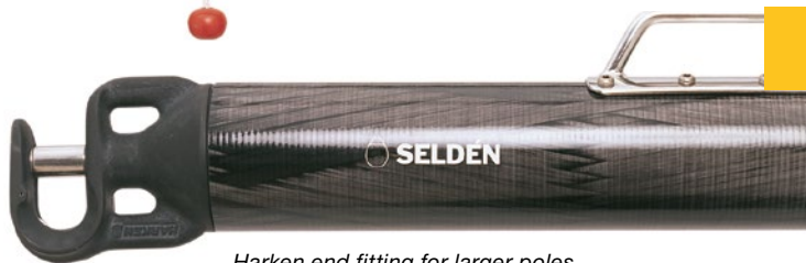
Harken end fitting for larger poles.

Weight comparison – aluminium and carbon spinnaker poles (equal strength). Aluminium spinnaker pole Section 99/99, length 5150 mm, weight 16.9 kg. Carbon spinnaker pole Section 102/102, length 5150 mm, weight 9 kg.