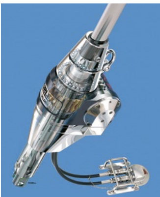
Furlex Hydraulic, deck gland and deck gland protection.