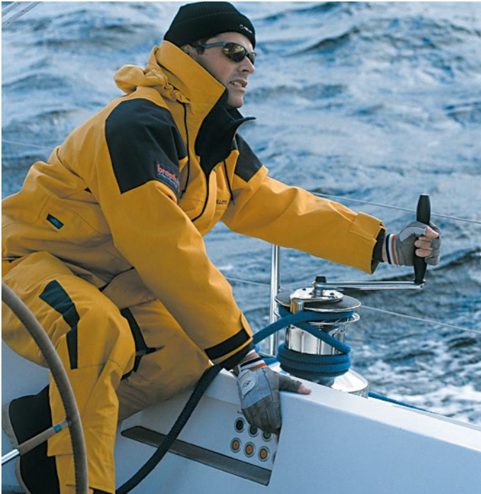
With a Furlex Hydraulic, the cruise control is complete. All you need to do is press a button in the cockpit and adjust the sheet.

The Furlex Hydraulic is designed to provide a harmonious visual interplay of stainless steel and aluminium. The hydraulic motor is located inside the worm gear, in the same way as it is with the furling mast system. The positioning of the motor contributes to the compact design of the Furlex Hydraulic.