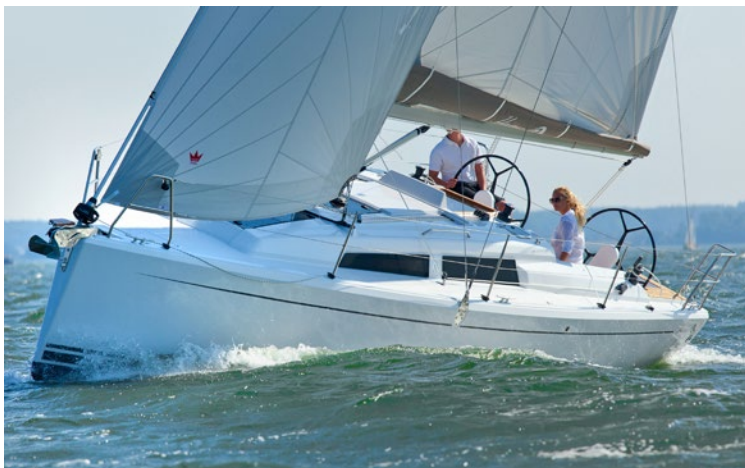
Hanse 315 featuring C153 mast section.

The four wheel IWS car simplifies hoisting, reefing and dousing a main sail fitted to our smallest mast sections in the Yacht-range. The car is made of composite making it strong and light