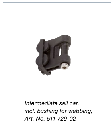
Intermediate sail car, incl. bushing for webbing, Art. No. 511-729-02